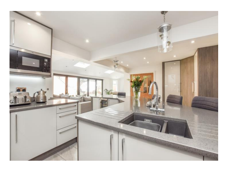
Garden Room 25' 11" x 9' 7" (7.89m x 2.92m)