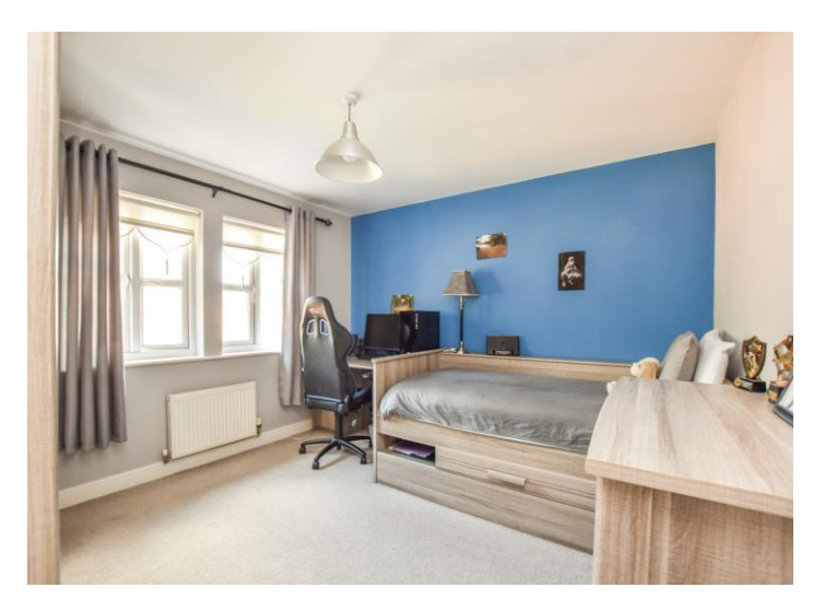
Bedroom Three 11' 8" x 9' 9" (3.55m x 2.97m)