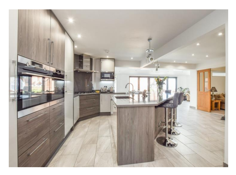
Kitchen / Dining Area 21' 2" x 15' 2" (6.45m x 4.62m)