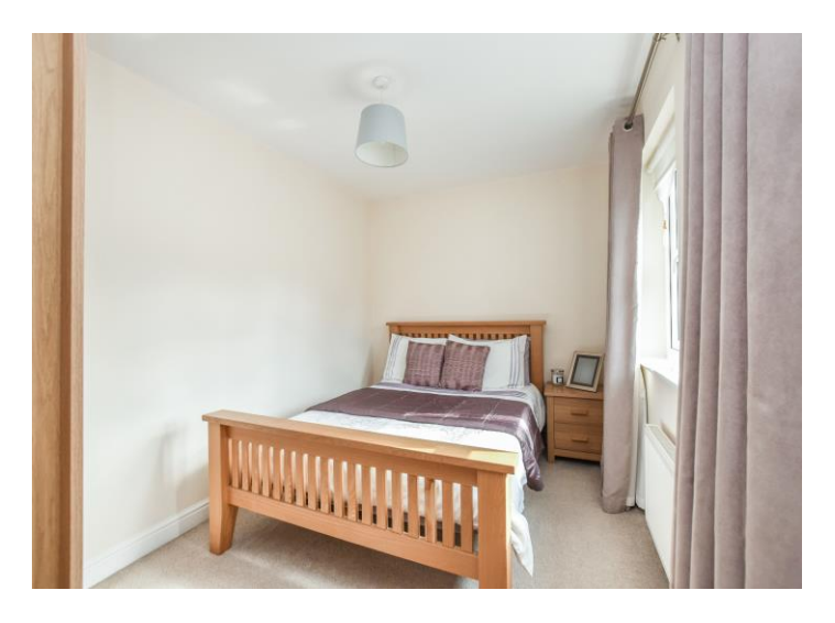
Bedroom Five 8' 1" x 7' 10" (2.46m x 2.39m)